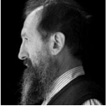
› Michele De Lucchi