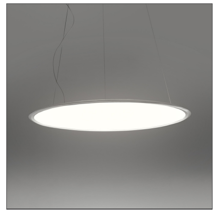
IP20 ⊕ 🕸 c€