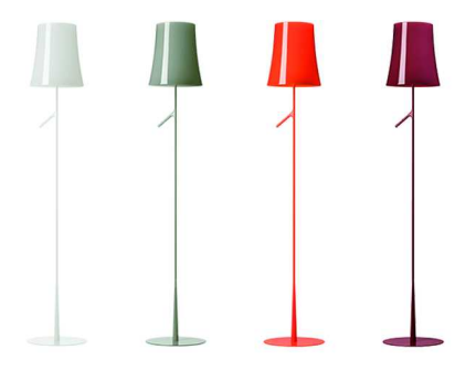
Brightness light semi-diffused and direct down light